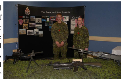
E&K Scot Weapons Display

Tentatively, Field of Valour will be hosted by the Regi-