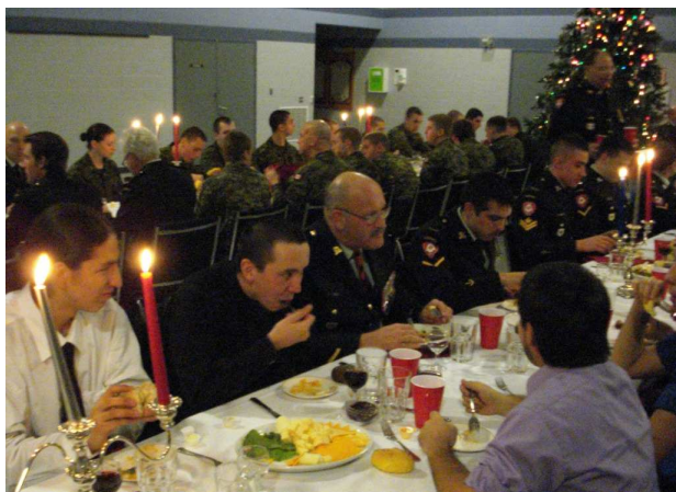
120 members of the Regimental Family enjoy soldiers’ Christmas Dinner at Tilston Armoury on 8th December. Dinner was served by Officers and Senior NCO’s.