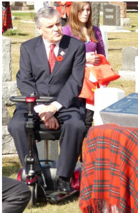
Lt Gov. at the Maple Leaf Cemetery Dedication

On 21 st October, 2009, 48 newly laid military headstones were commemorated in a ceremony in Legion Memorial Field, a section of Chatham's Maple Leaf Cemetery devoted to military veterans. The Honourable David C. Onley, O. Ont, Lieutenant-Governor of Ontario, was the guest of honour for the commemoration and unveiling of the new headstones. This sombre and very moving event was attended by approximately 200 local dignitaries, politicians, veterans, soldiers, Legion members, musicians, participating students and