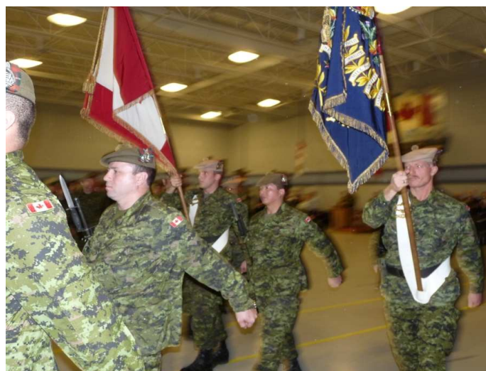
Colour Party marches past their new Honorary Colonel