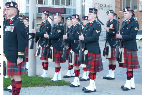
Present Arms to 'Last Post'

and a message of inspiration was delivered.