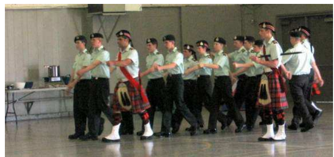
59 RCACC on Parade!!!