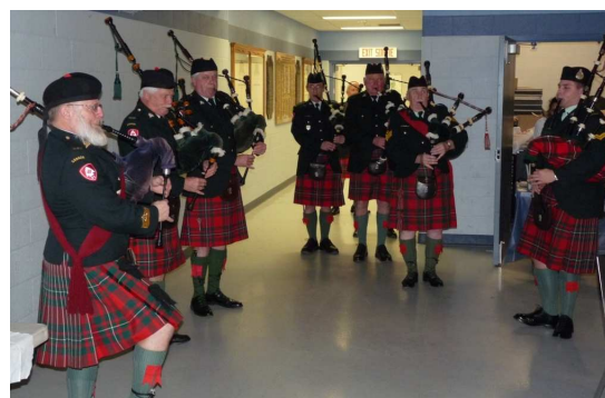
Pipes and Drums playing 'Amazing Grace' to accompany the Caledon tenors