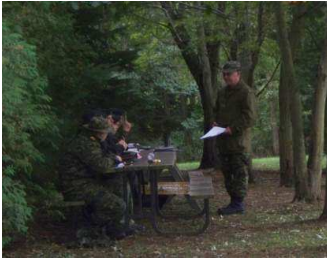
59 RCACC attends Seniors Weekend Leadership Camp in October 2009