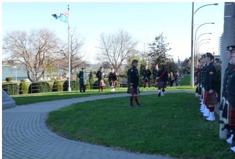
Wreath laying at Dieppe Memorial Windsor.

On 11 th Nov, the Regiment had representation in numerous communities through our Regimental Area Of Operations in South-western Ontario. In Windsor, a contingent of E&K Scot paraded at the Dieppe monument