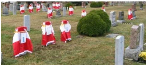
New Headstones covered with Canadian flag

The 48 headstones were each covered by a Canadian Flag which was removed by students from John