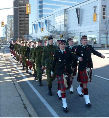
Soldiers marching to Dieppe Park.

there is a much higher awareness of the great deeds being performed by our men and women domestically and abroad.