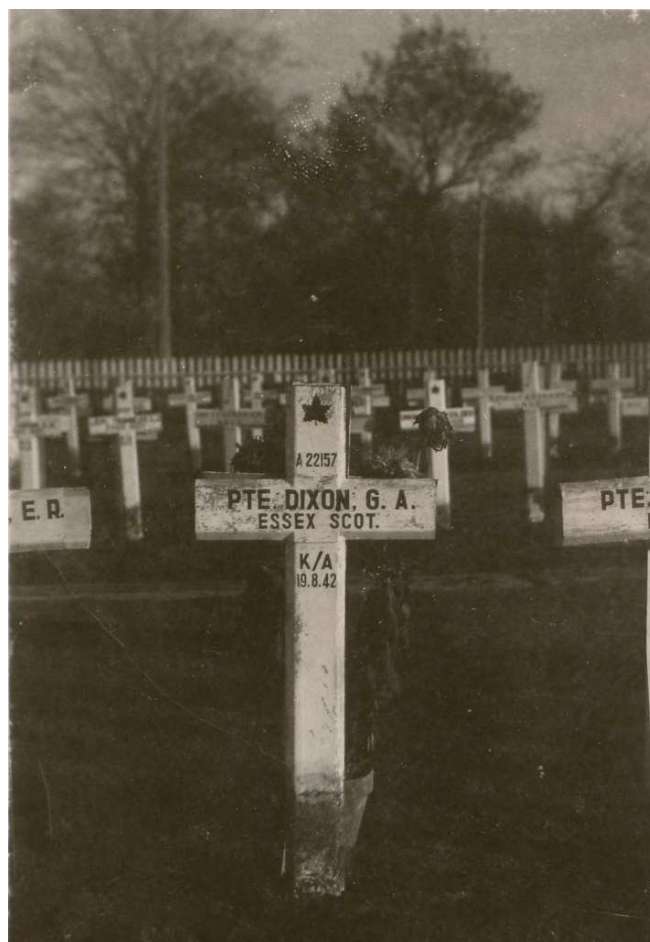
Canadian War Cemetery Hautot Sur Mer in F 24.