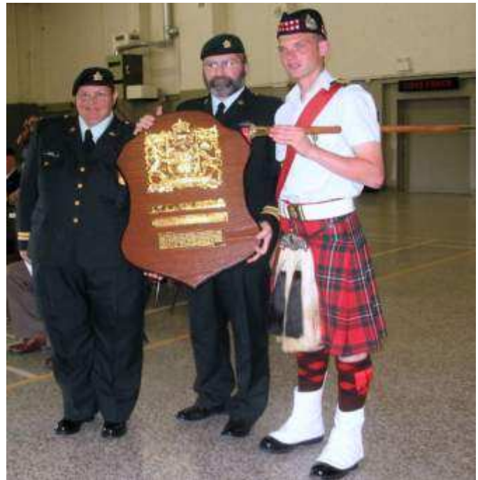
59 RCACC receives the Strathcona Award during the Corps annual inspection of 2009.