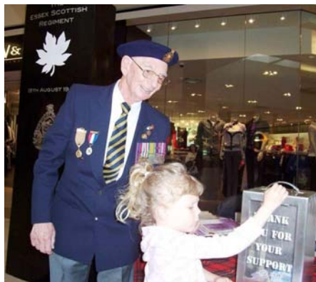
Little girl donates her allowance