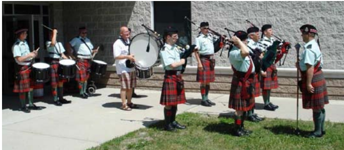
Pipes and Drums 'strut their stuff'