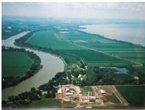
Aerial view of the Bradley Farm