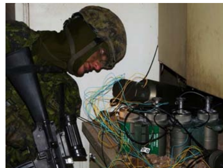
Improvised Explosive Device

Coalition Force patrols followed the insurgents operating 'technicals' (armed pickups) to a bomb-manufacturing plant. Later, in the dead of the night, a large fighting patrol attacked the bomb