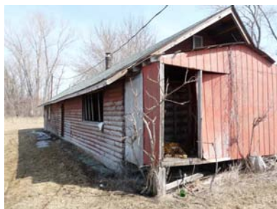
Insurgents 'Bomb Factory'

Farm to E&K Scot to conduct an intense field training exercise (FTX). There are a number of close-knit Bradley families living on the farm in the large housing compound, and in the centre, on the river, is located a very large three storey hunting lodge complete with most hotel amenities.