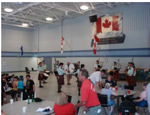
P&D performs a 'set'

ciation hosted this event and chose a date where the maximum number of soldiers were available. Since our Reunion is this 11 th September, the Family Day was planned for late spring.