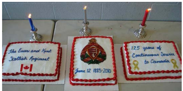
125 years continuous service to our Country

The BBQ was a great success with everyone getting their fill for $5.00. The large Regimental cake was an impressive three different cakes brought together with each being pudding cream-filled, to the delight of everyone. Many thanks to Cakes