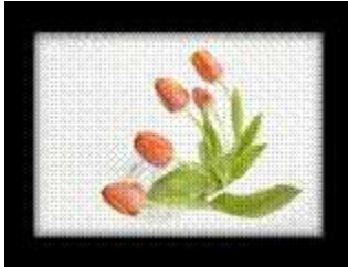
'Fashion in Bloom' logo