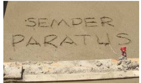
This proves that cement masons were once kids

Students wash the sea salt from the 'Red Beach' stones recently arrived from Dieppe, France. Beach stones will be cemented to the base of the monument