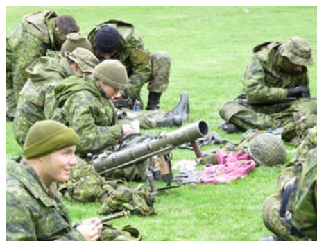
Post-Exercise Weapons Cleaning

assistance of a contingent from 705 Communications Squadron from Hamilton which provided the tactical and safety nets working out of the hunting lodge. Four medical technicians from 23 Field Ambulance located in