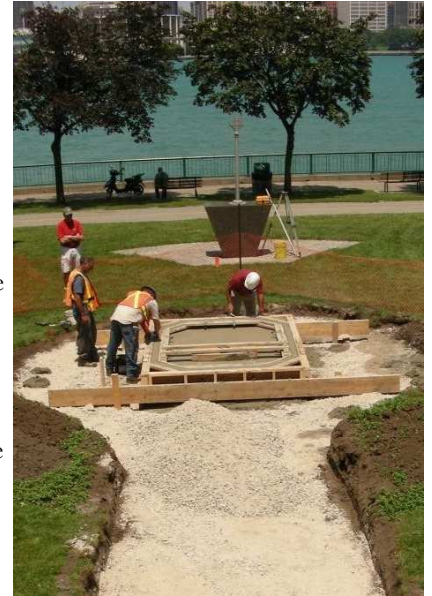
Site prepared for DMP II Monument

Our hats are off, to the City of Windsor for the sidewalk around the monument and reworking the grass and gardens around the memorial and to the Ville de Dieppe for collecting and donating the Dieppe beach stone to be set in the surface of the foundation around our monument. We have great appreciation to the students of Massey, Walkerville and Sandwich Secondary schools and a couple of their teachers who donated their time Thursday past, to wash a ton (literally) of beach stone, to remove the English Channel salt.