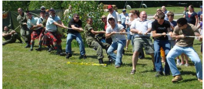
Regimental Family members struggle against E&K soldiers

an squirt-gun ambush maze, and balsam airplanes for the kids. The teenagers enjoyed archery, basketball and sorting out 'bad guys' on the Small Arms Trainer (SAT). Driving a golf ball into the back of an army truck, a water-balloon toss with their spouse (this was a 'trust-building' exercise, with very limited results!) were the adult competitions. The tug-of-war between the soldiers was a draw. The pipers' and drummers' and Association members' team did not have an advantage against the soldiers' team as all were 'haggis-fed', but it was a great tug-of-war struggle! The Pipes & Drums performed all the