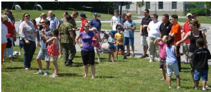
Regimental Family watches competitions

an squirt-gun ambush maze, and balsam airplanes for the kids. The teenagers enjoyed archery, basketball and sorting out 'bad guys' on the Small Arms Trainer (SAT). Driving a golf ball into the back of an army truck, a water-balloon toss with their spouse (this was a 'trust-building' exercise, with very limited results!) were the adult competitions. The tug-of-war between the soldiers was a draw. The pipers' and drummers' and Association members' team did not have an advantage against the soldiers' team as all were 'haggis-fed', but it was a great tug-of-war struggle! The Pipes & Drums performed all the