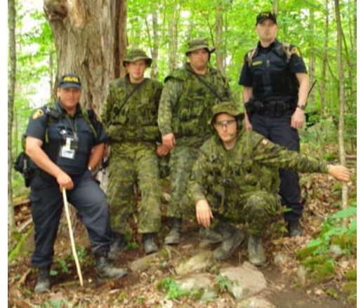
O.P.P. training with E&K Scot members

collective field exercise where our soldiers were assessed and granted Operation Readiness Certification by the Commanders of Joint Task Force Central and Canada Command. During the validation exercise, our platoon had the distinction of being chosen to undergo a complete decontamination by the CF's Chemical, Biological, Radiological and Nuclear (CBRN) Response Team.