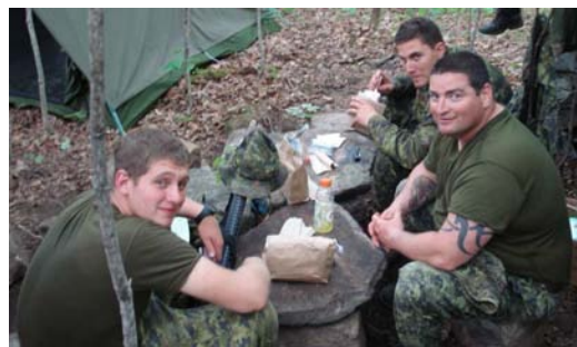
Troops enjoy lunch in the field

Our troops, as part of Task Force Huntsville, deployed from Meaford to the Joint Operations Area surrounding Huntsville