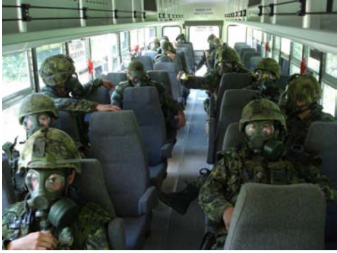
Training for tear gas operations

RCMP led Integrated Security Unit, responsible for providing security to world leaders attending the G-8 and G-20 Summits in Huntsville and Toronto. In all, there were approximately 1,000 Reservists and 800 Regular Force members committed to this operation.