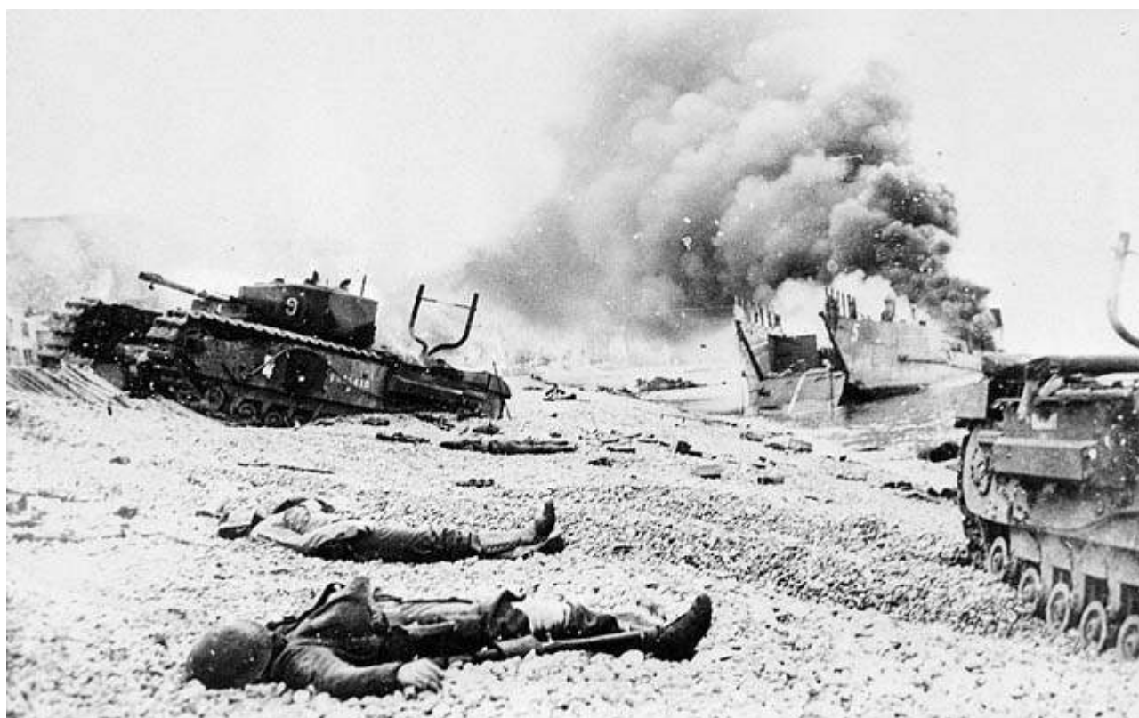
The Beaches of Dieppe 19 August 1942

To order your copy today please contact LCol (Ret'd) Hardy Wheeler at: hwheels@primus.ca