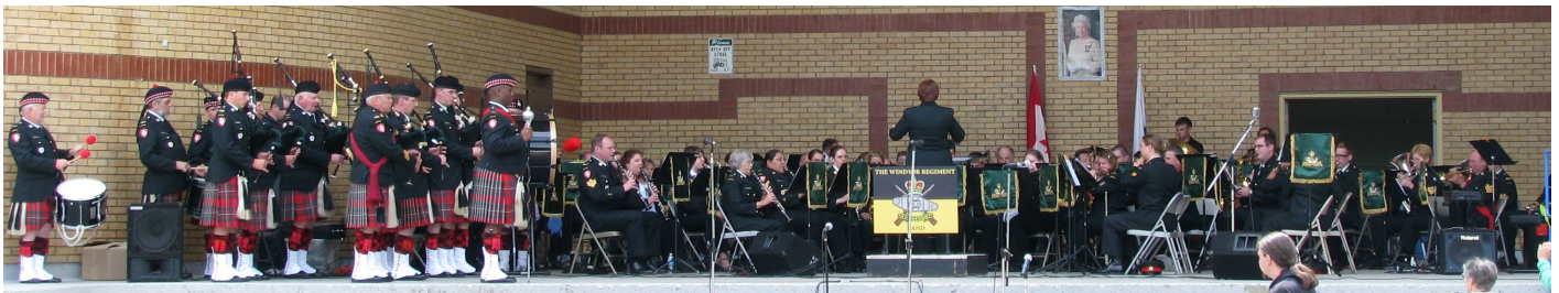
Massed Brass Bands of Royal Hamilton Light Infantry, Windsor Regiment and The Essex & Kent Scottish Pipes & Drums playing 'Highland Cathedral' in the band shell at Victoria Park, London on 3rd June 2012.