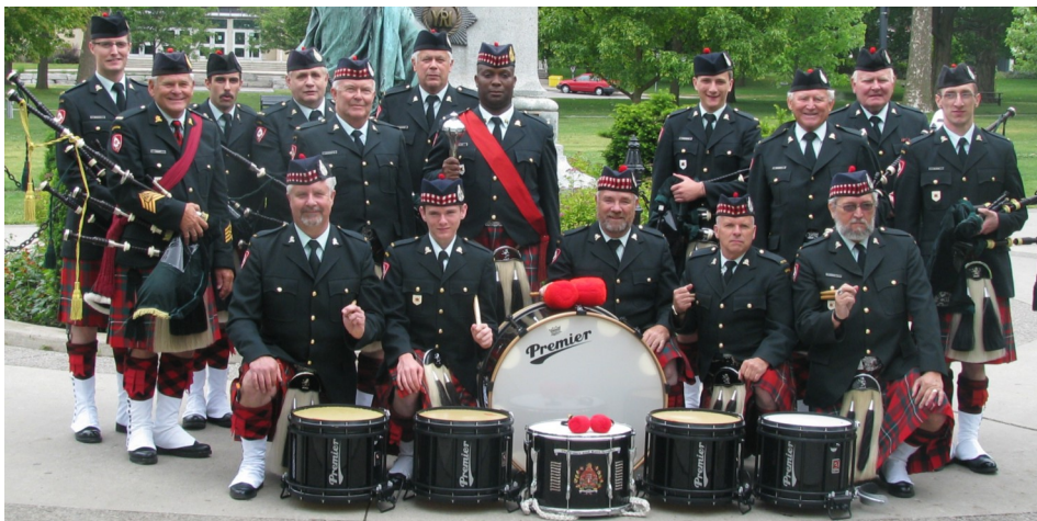
Pipes & Drums of The Essex & Kent Scottish in concert, Victoria Park, London