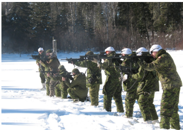
Live firing at targets protected behind a snow berm

defensive position. Platoons built snow shelters out of natural materials to teach troops the skills needed in order to survive in the cold wilderness should they be separated or lost.