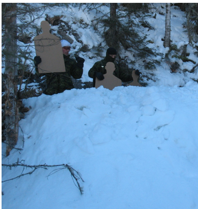
Soldiers learn lesson on the limited stopping power of a snow berm against different ammunition.

defensive position. Platoons built snow shelters out of natural materials to teach troops the skills needed in order to survive in the cold wilderness should they be separated or lost.