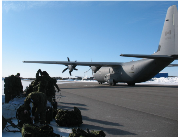
RCAF CC 130 Hercules Trooplift Aircraft at Sioux Lookout

troubleshooting Coleman lanterns and stoves. The skills were basic, but invaluable when the theatre becomes real and the temperature falls below -30°C.