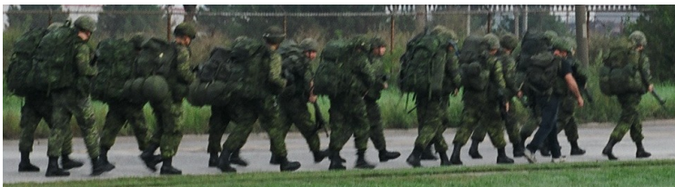
E&K Scot soldiers commence timed 13 km Battle Fitness Test