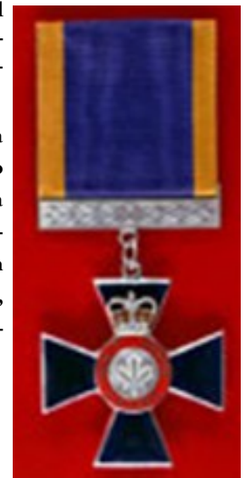
Medal of Military Merit (M.M.M.) and undress ribbon bar Motto on M.M.M.: 'Service Before Self'