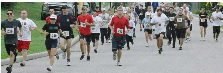
Runners 'Trot With The Troops'

'Trot With The Troops' is scheduled for Saturday, Sept 15 th . Similar to last year, we need your assistance in TWO ways: